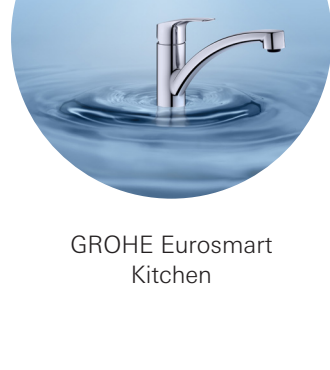
The Cradle to Cradle Certified® Product Standard