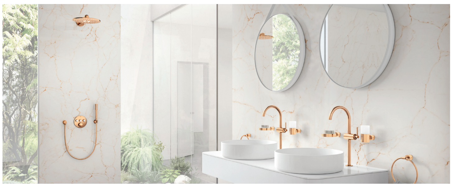
GROHE full bathroom solution in Warm Sunset

In addition, GROHE is are also offering the consumer the freedom to create their individual kitchen and bathroom space with the long-lasting GROHE Colors Collection .