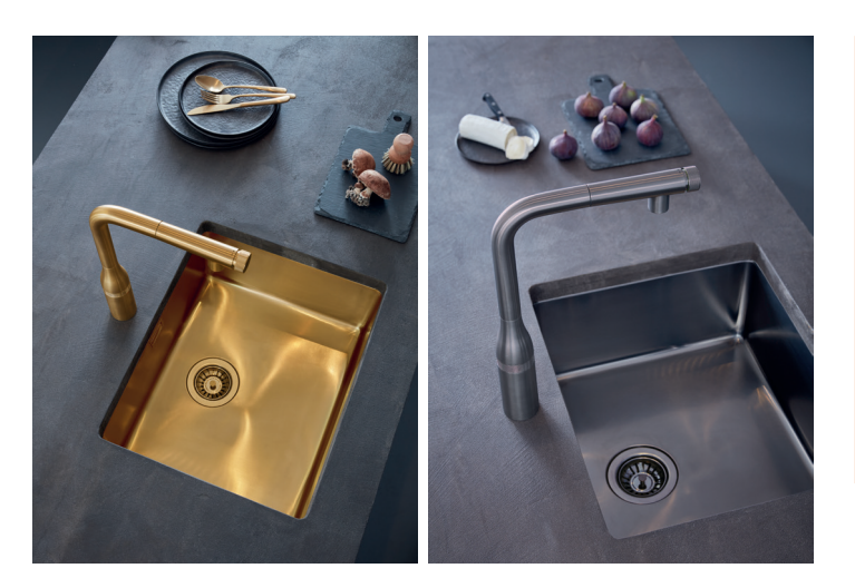
GROHE SmartControl Kitchen in Cool Sunrise and Hard Graphite

The once functional room becomes a living space, which also increases the expectations of the products – consumers are looking for smart, intuitive helpers that simplify everyday routines. At the same time, consumers want to be actively involved in the design process and products should reflect their individual style as well as the design of the other rooms."