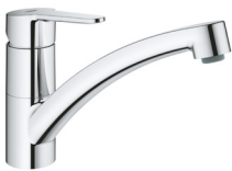
GROHE BauEco sink mixer low spout

GROHE Baulines kitchen is available in round and square design options, as well as low, medium and high spout variants ensuring there is an ideal solution for every customer and project. All spouts offer an optimal height spout position, allowing for convenient operation for cooking and cleaning tasks.