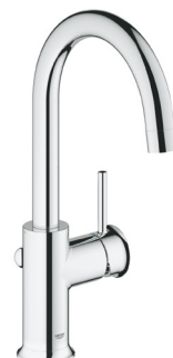
GROHE BauClassic sink mixer high spout