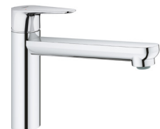
GROHE BauCurve sink mixer medium spout