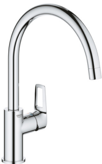
GROHE BauLoop sink mixer high spout